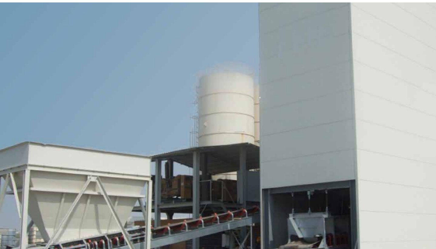
Batching plant and cooling system

“OUR INTENTION IS TO BE THE MARKETING AND TECHNICAL ARM FOR THE NEW COOLING TECHNOLOGY”